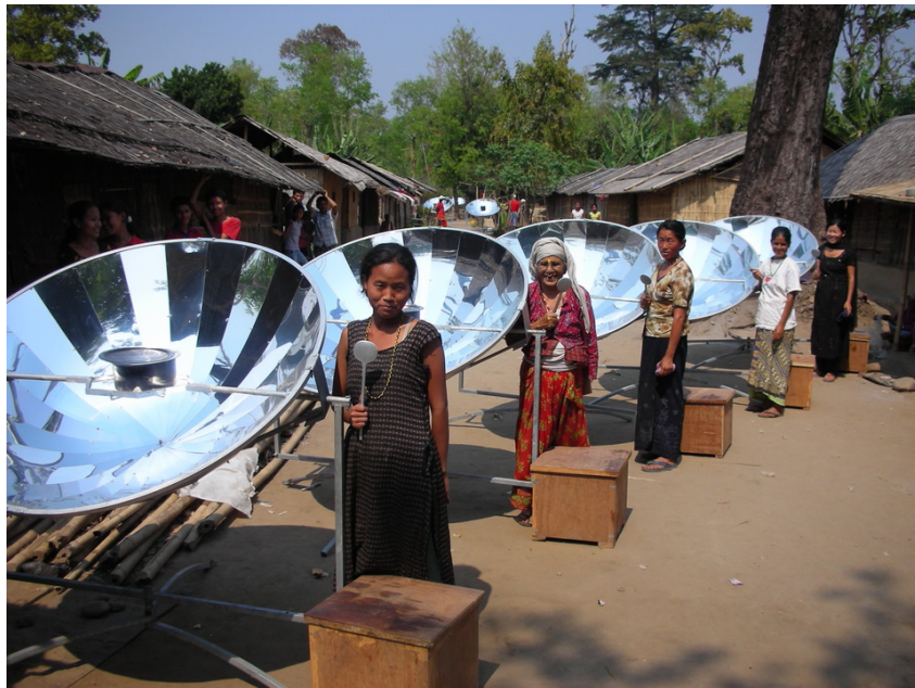
Refugees in line showing demonstration of solar cookers