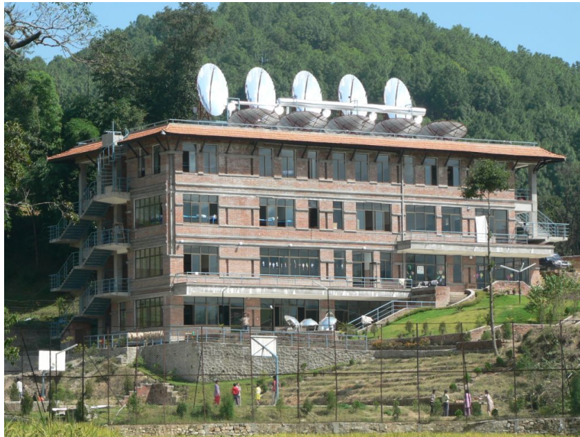
Solar Steam Cooking using Scheffler Dishes at the First Green School in Nepal of Vajra Academy

And if that is not enough, now MSA Renewtech Foundation the section 25 company of Muni Seva Ashram (The Green Ashram) is helping them with their New project Vajra Eco-resort coming up in Tatopani near border of China on the tourist route of pilgrims going to Mansarovar ! MSA Renewtech Foundation is total turn-key Solution Provider for the project and the Eco - Resort with have a 45 sqr mtr Parabolic dish for cooking, Solar Hot Water Systems, Biogas Plant, Solar PV System, LED Lighting fixtures in all rooms, LED Street lights, Small Wind-Mills etc. !! The whole resort is designed with passive architecture and built with as much as possible locally available raw materials and thus has green architecture ! The Vajra Foundation Nepal has worked tirelessly to promote an alternative : solar energy & various other Renewable Energy technologies through their various initiatives, hard work & sustainable vision.