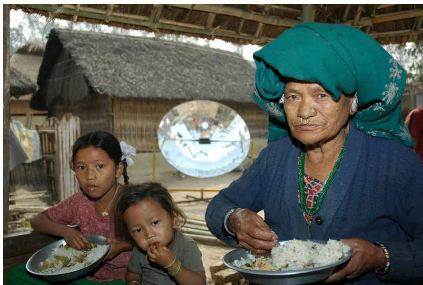
Refugee Beneficiaries with their families having their meals cooked with the help of Solar Cookers