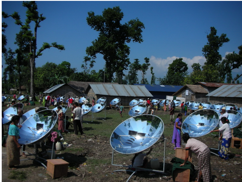
Worlds Largest Solar Cooking Project in Bhutanese Refugee Camps